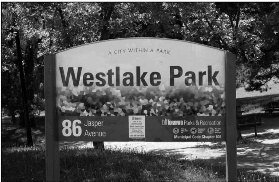
Bottom: The descriptive plaque at Westlake Memorial Park.