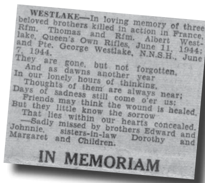
Below: An obituary from the Toronto Evening Telegram.

hours of thinking, Thoughts of them are always near; Days of sadness still come o'er us' Friends may think the wound is healed, But they little know the sorrow That lies within our hearts concealed. 29