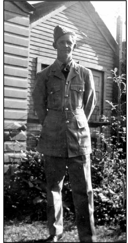
Westlake Family Papers