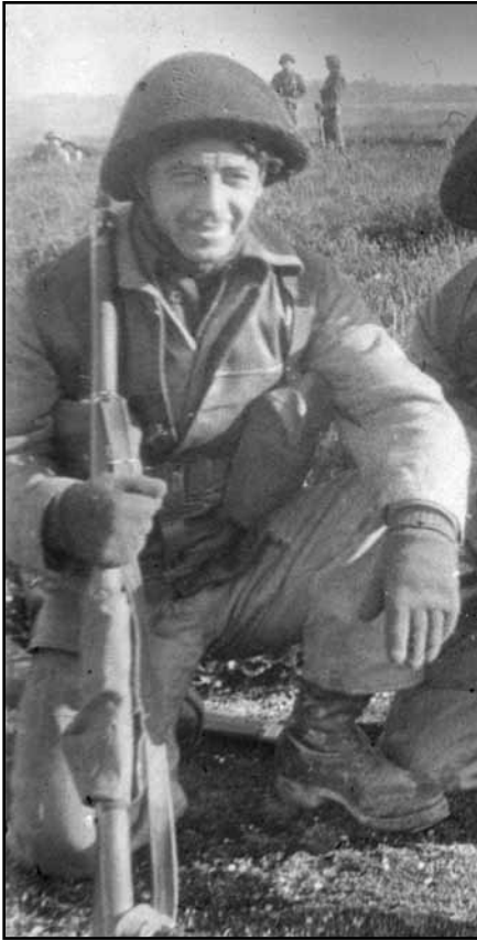
Westlake Family Papers