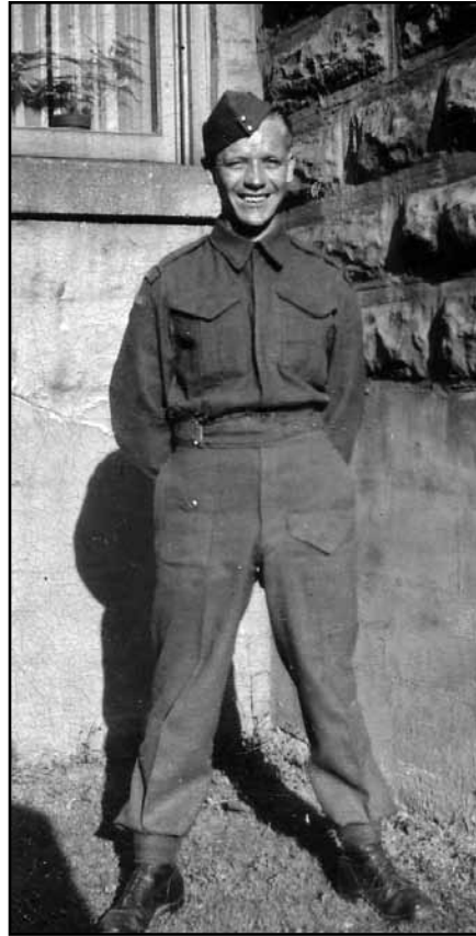
Westlake Family Papers