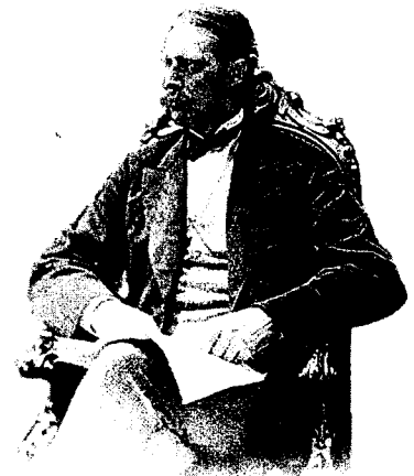
Figure 7-8 William McDougall

E Read the Voices feature on this page. Why do you think Macdonald saw McDougall's actions as "humiliating" to Canada?