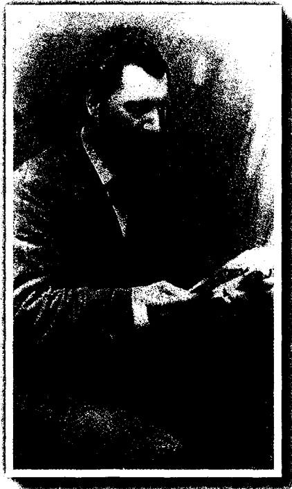
Figure 7-7 Louis Riel, c. 1865